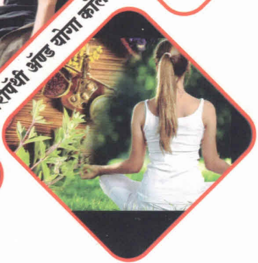
नॅटारंजी अँड योगा कॉलेज