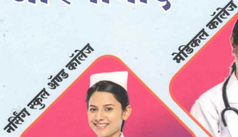
नर्सिंग स्कूल अँड कॉलेज