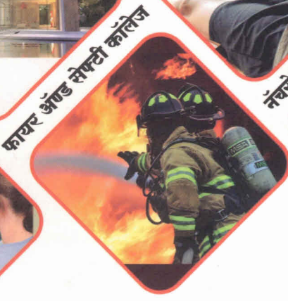
फायर अँड सेफ्टी कॉलेज